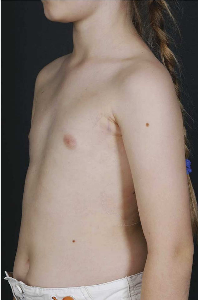
Fig. 4. Photography of the same patient with the arm adducted; the incision is virtually invisible.

results [4] when compared to RV pacing, as determined by blood pressure, pulmonary capillary wedge pressure, and V-wave appearance [3].