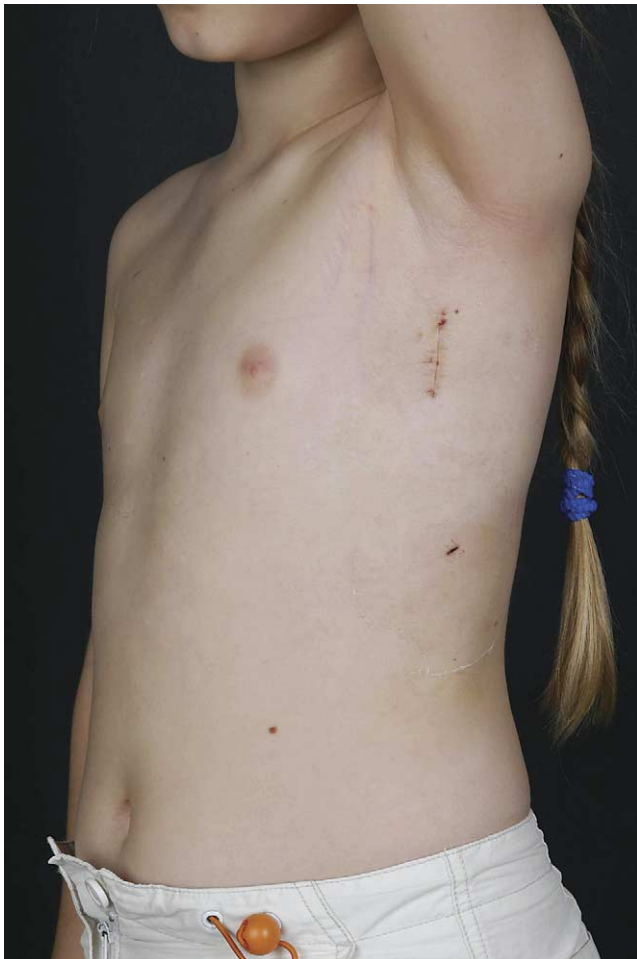
Fig. 3. Post-operative photography of the mini-lateral left thoracotomy incision from a lateral view.

At 1 and 5 years, atrial lead survival was 94 and 86%, respectively, and ventricular lead survival was 97 and 86%, respectively. Reoperations for new lead placement were required in five children: two for lead fracture, one for insulation break, one for oversensing, and one pacing system infection. Reprogramming was done in three devices, for atrial lead dysfunction in one child, for pacing failure in another, and for ventricular lead fracture in the last. On serial echocardiographic follow-up, there was no sign of global or regional LV dysfunction, and ventricular dimensions remained unchanged.